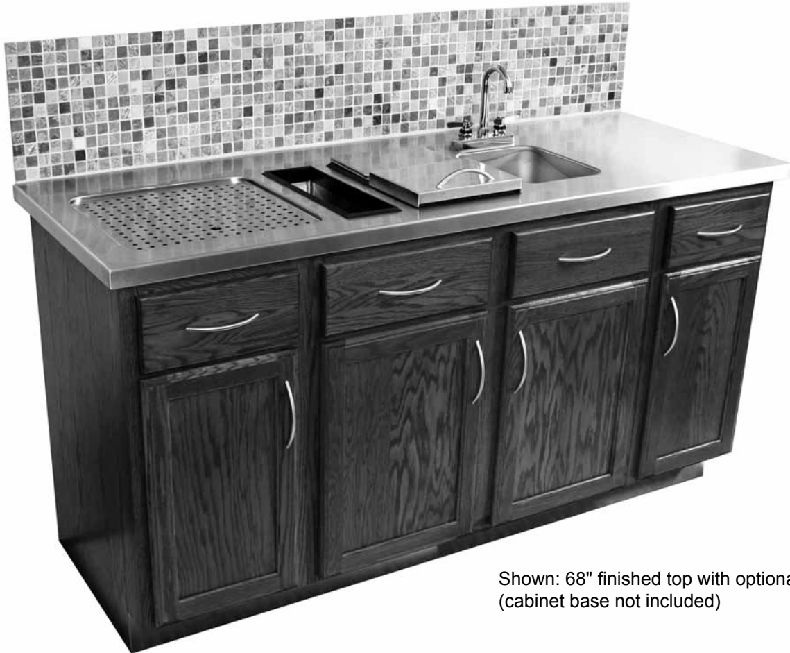
Shown: 68" finished top with optional faucet (cabinet base not included)

Thank you for purchasing Glastender's Finished Top Cocktail Station. We appreciate your support of American manufacturing. The Finished Top Cocktail Station is a high quality, commercial-grade product that, if cared for properly, will bring you many years of enjoyment.